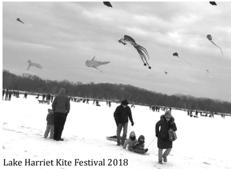
Lake Harriet Kite Festival 2018

Art Shanty Projects Partners with Kite Festival - January 26