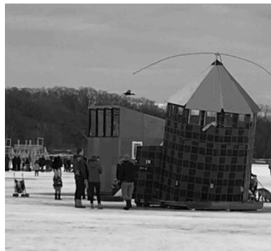
Art Shanty Projects on Lake Harriet in 2018.