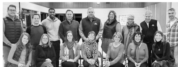
Current LHiNC Board Members (2018-2019)

Linden hills.org/get-involved/join-lhinc