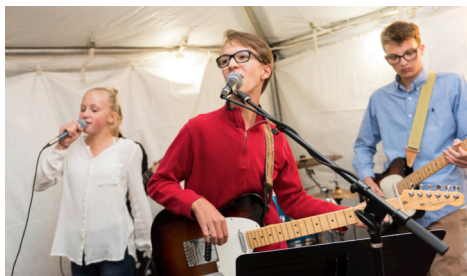
612LIVE had guests dancing, clapping and cheering for more. For more photos, visit: www.lindenhills.org/TasteofLH