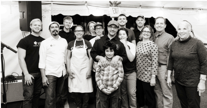
Chefs, owners and servers from the restaurants at the Taste.

On September 26, more than 175 people came out to support the second annual Taste of Linden Hills hosted by the Linden Hills Neighborhood Council (LHiNC) and Rose Street Patisserie. The event raised more than $7000 for LHiNC's grants program that supports projects and organizations that make Linden Hills a better place to live and work.