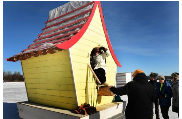
The Birdhouse Shanty, 2017

Art Shanty Projects, which just celebrated its 10th year this February, brings together artists of many disciplines to transform a frozen lake into a creative community space. Inspired by Minnesota's unique ice fishing houses and culture, Art Shanty Projects commissions about 20 artists each winter to produce diverse, multi-disciplinary shanties that encourage audience engagement.