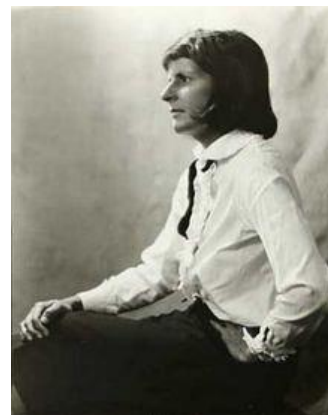
Brenda Ueland. 1930

But who was Brenda Ueland and why is she important to us in Linden Hills? Digging into her history reveals that she did many things in life, but most prominently was a lauded journalist, editor, freelance writer, and teacher of writing. She is best known for her book If You Want to Write: A Book about Art, Independence and Spirit , which has sold over 280,000 copies since it was published in 1938, and has been translated into Japanese, Korean, and Spanish. Carl Sandburg reportedly referred to the book as "the best book ever written about how to write."