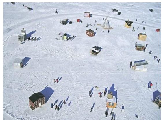
Art Shanty Village on Ice, as Seen from Above

To learn more about Art Shanty Projects and view more photos, visit ArtShantyProjects.org .